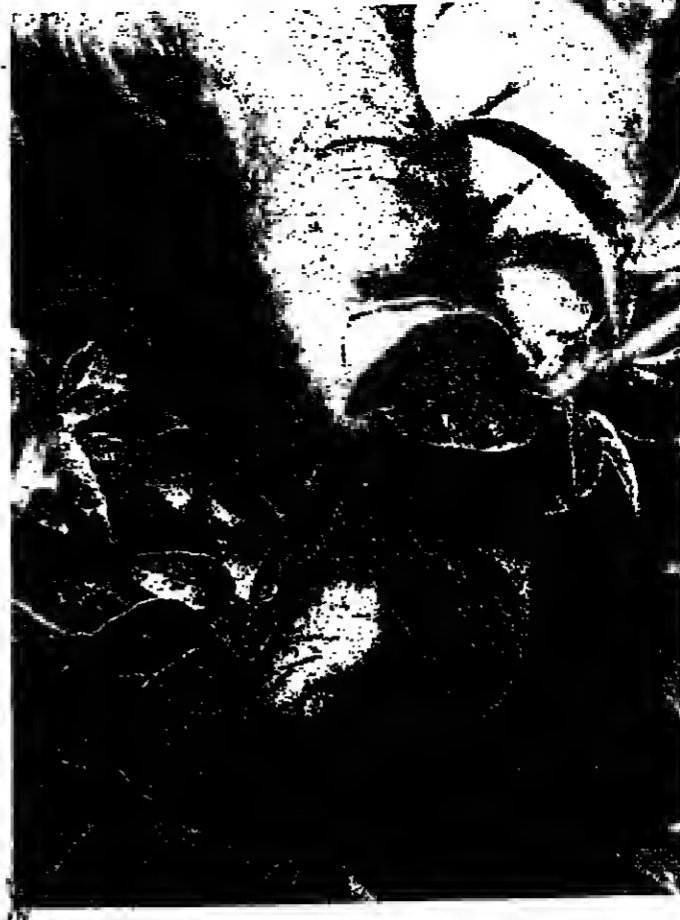
Yisrael Braun holds a lemon balm plant before potting (left) and examines its leaves (right). Centre, he looks over a row of fragrant marjoram plants in the kibbutz greenhouse.